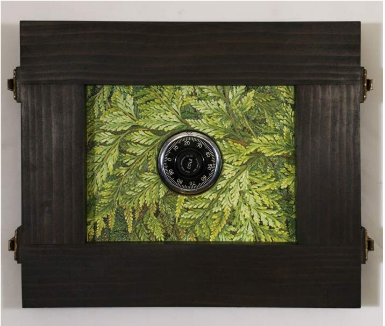
8 13 21, 16" x 20" x 3", oil on wood, safe lock, hardware