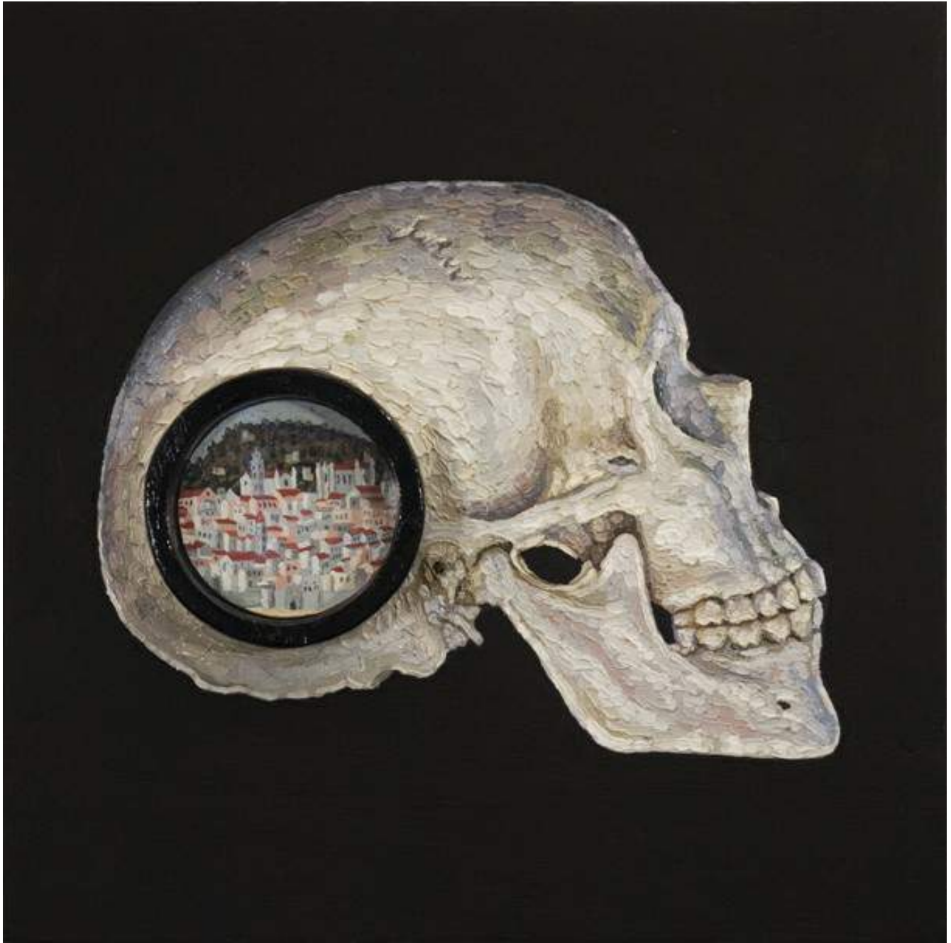
Site Specific , 11" x 11" x 2 1/2", oil on wood, plexiglass