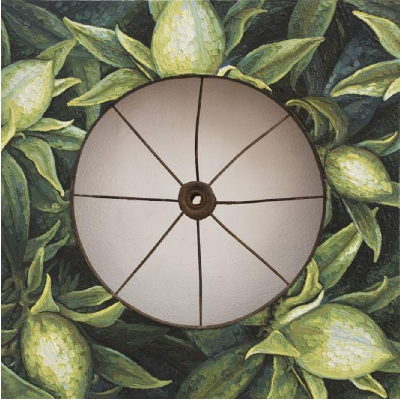
Turn Out , 21" x 21" x 3 1/2", oil on wood, wheel