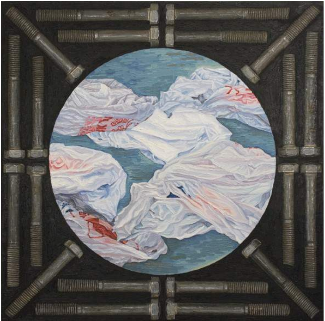
Cross Thread , 22 1/2" x 22 1/2" x 2", oil on wood