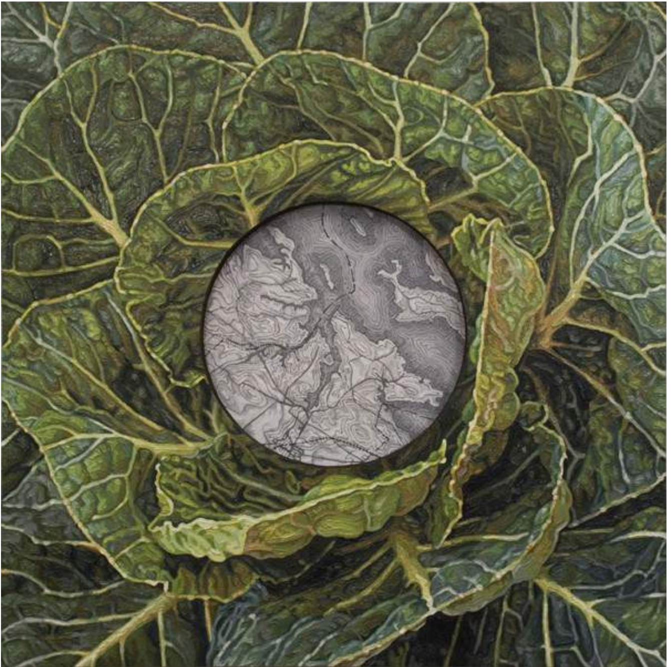
Neutral Ground , 29" x 29" x 2 1/4", oil on wood