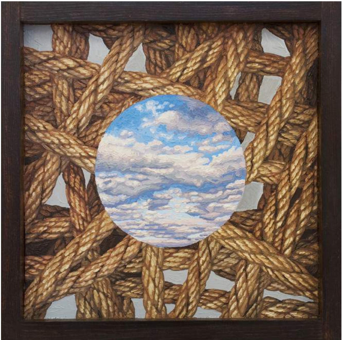
Twisted Vision , 12 1/2" x 12 1/2" x 2 1/2", oil on wood