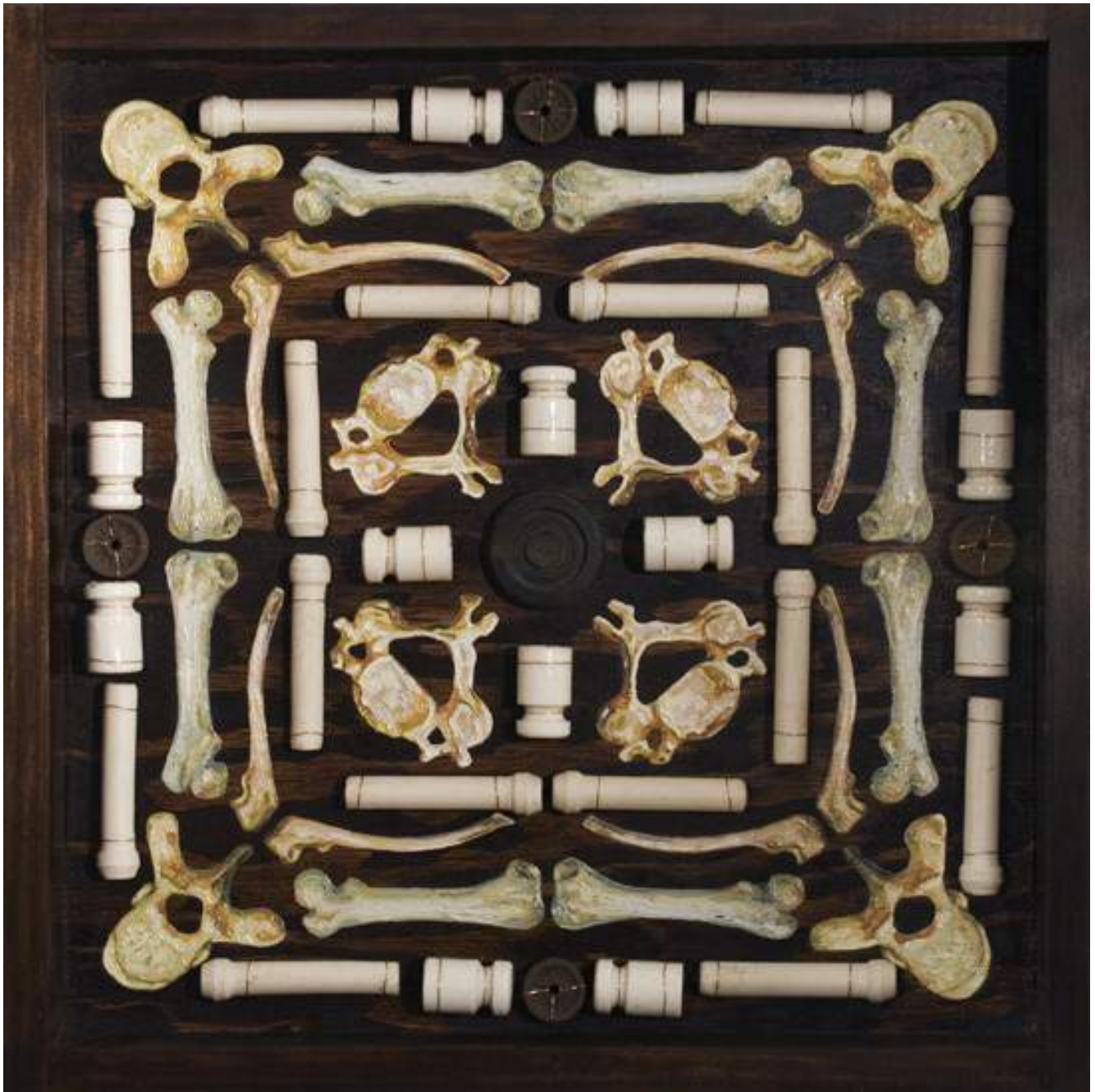
Nonconductive, 19" x 19" x 2 1/2", oil on wood, knob and tube, wire