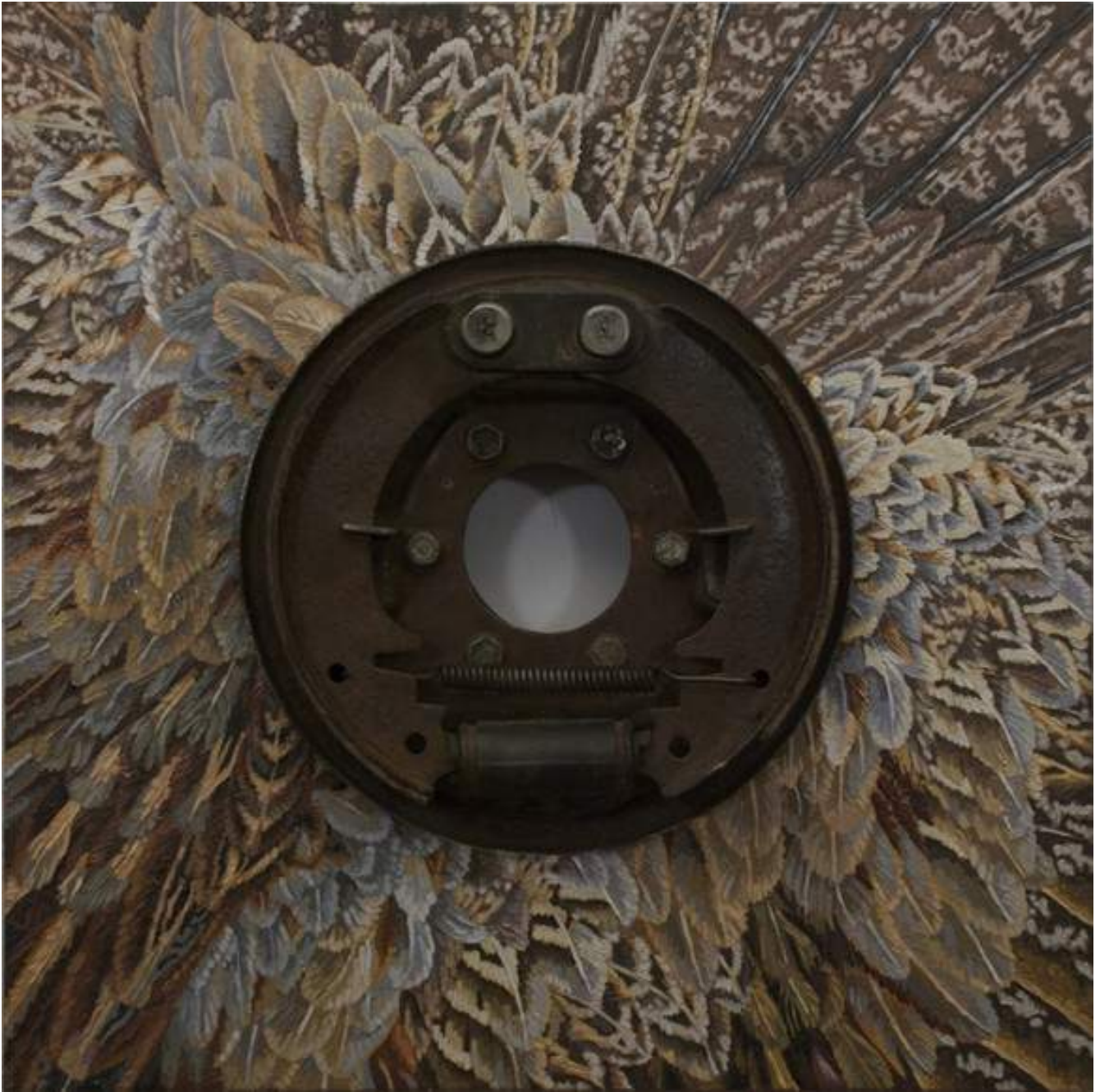
Break Down, 17 1/2" x 17 1/2" x 3 1/2, oil on wood, Willy's jeep brake