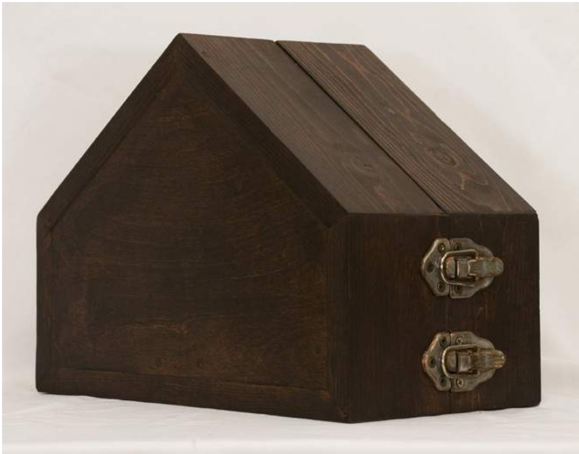
Light Box , 10" x 27" x 3 1/2", oil on wood, hardware 10" x 13" x 7" (closed)