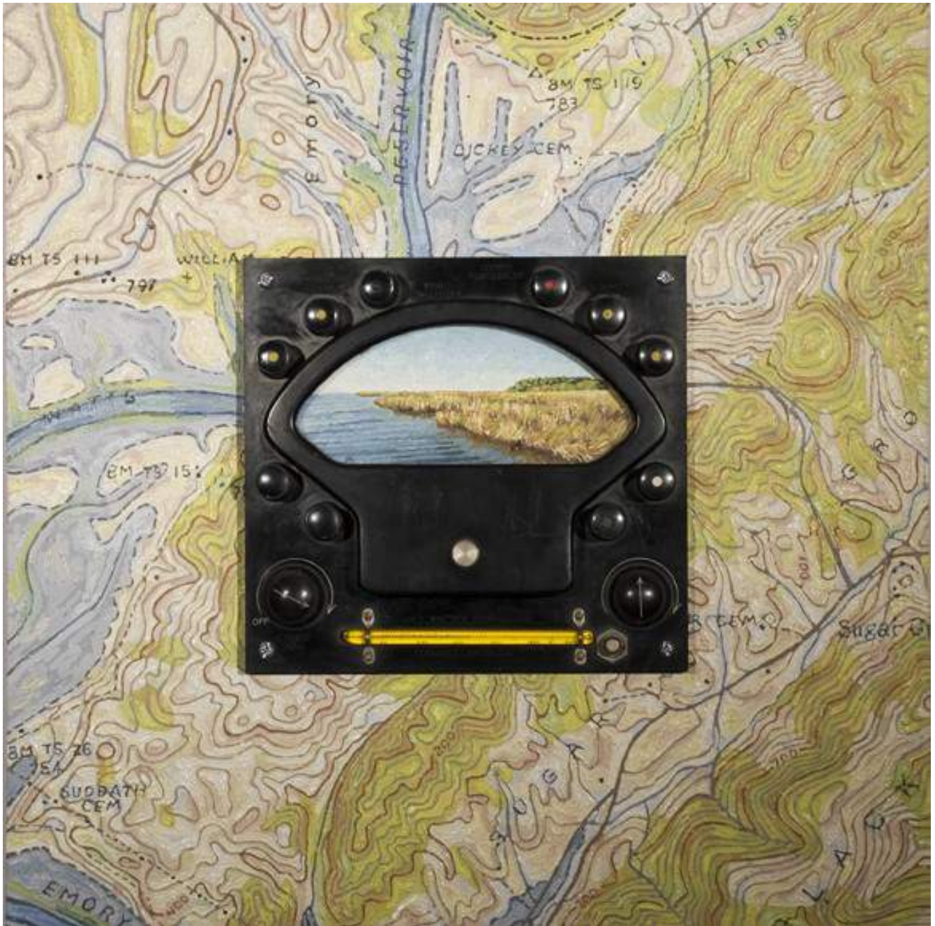
Farther Away , 17" x 17" x 3 1/2", oil on wood, control panel