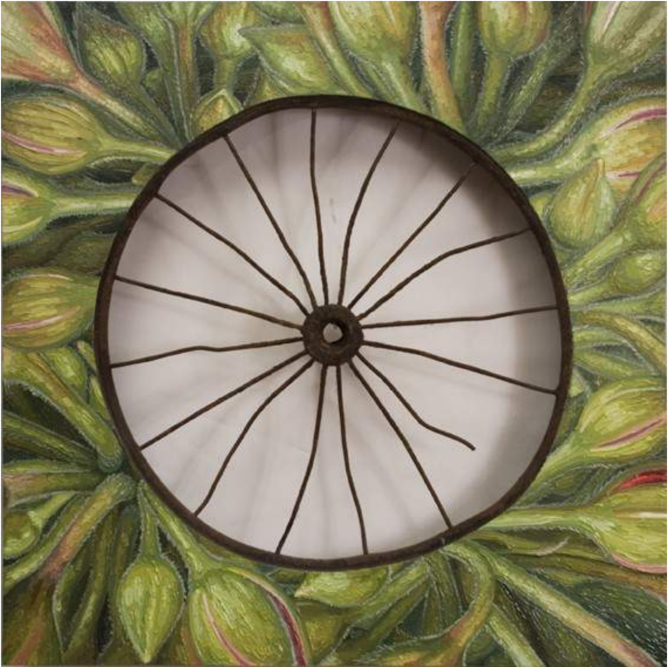
Retread, 22 1/2" x 22 1/2" x 2", oil on wood, metal wheel